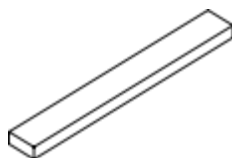
Flexural testing specimen GB/T 9341