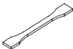
Tensile testing specimen GB/T 1040